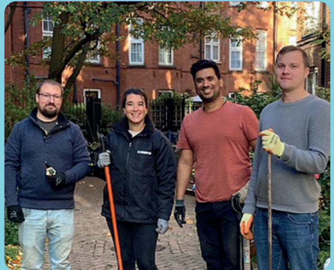
Mace staff on a volunteer day at the Sutton estate

It has been a busy few months on the Sutton estate with lots of progress being made and some great events. From senior lunches in the K&J lounge, a pantomime trip, the launch of our E-Brik site as well as some fantastic volunteer days, it has been great to see so many of you. Read on to see what is coming up next!